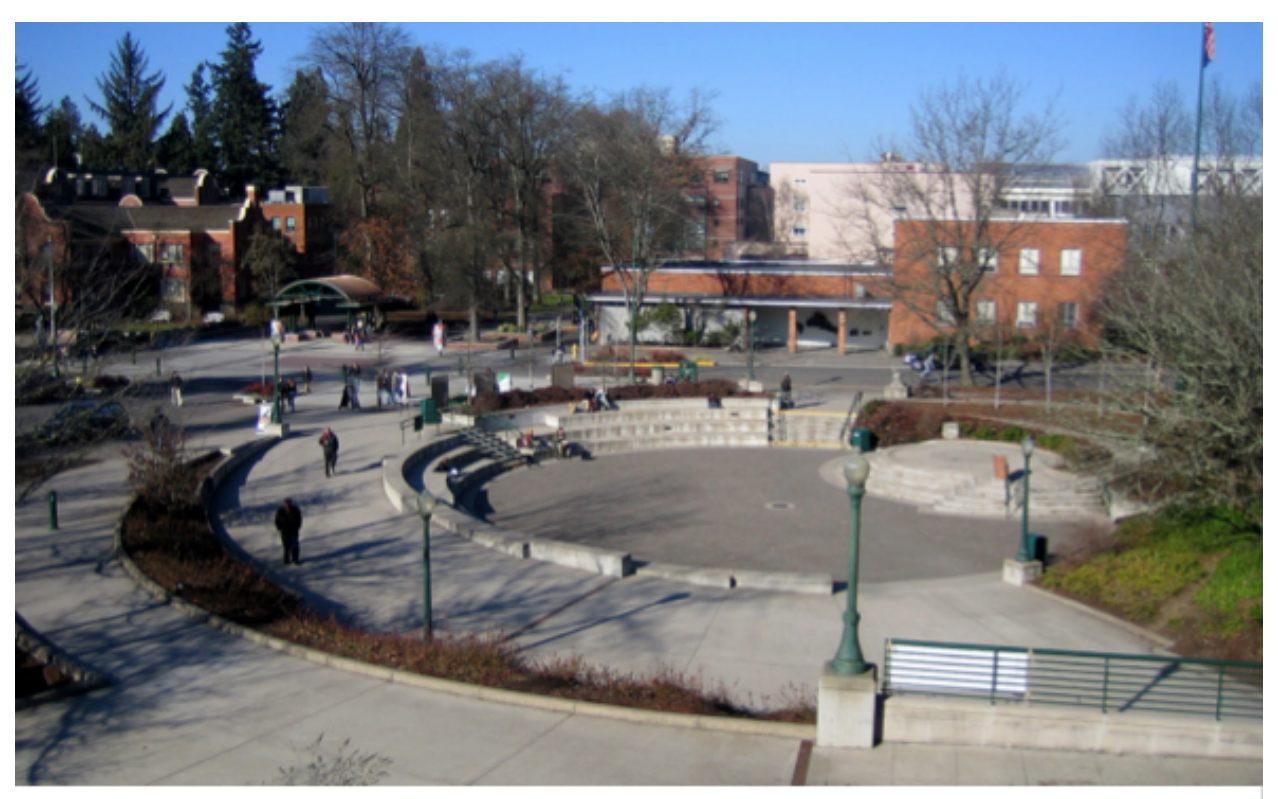
"The building of communities, an identity, a sense of belonging, and an opportunity for the exchange of ideas, is an important part of the successful university."